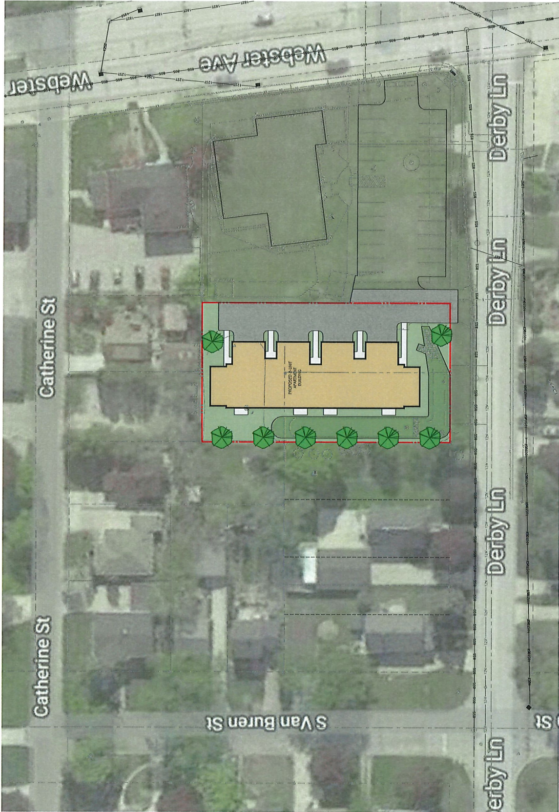
SITE DEVELOPMENT PLAN SCALE: 1" = 20'-0"